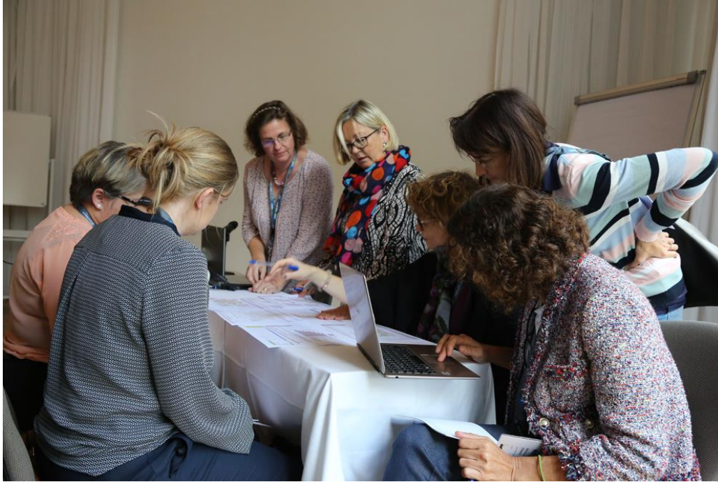
A team of ESN researchers look at the “feeling-good”-data in Berlin in October 2017.